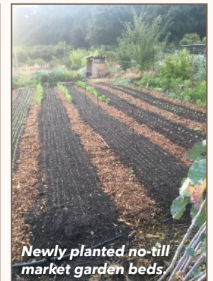
Newly planted no-till market garden beds.